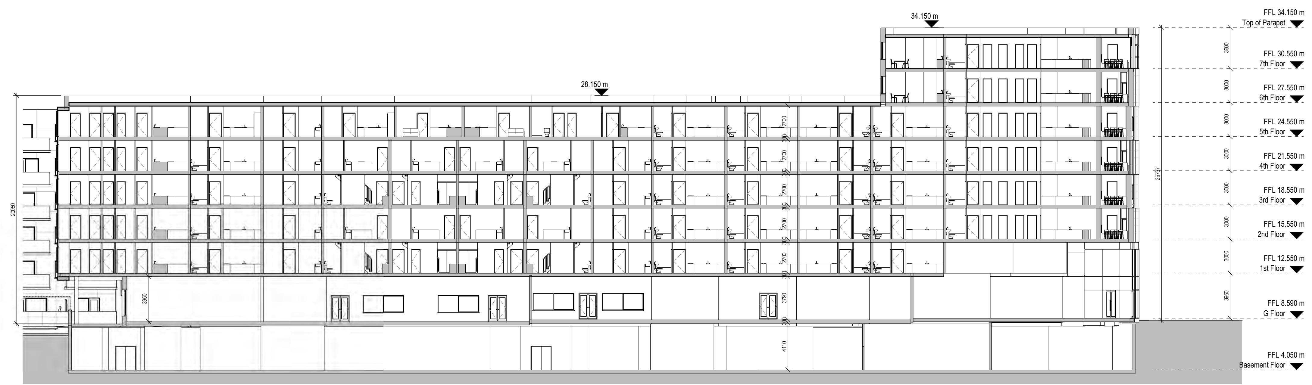
BLOCK 14B SECTION C-C Scale 1 : 200

GENERAL NOTES - ** Do not scale from this drawing *** Use figured dimensions only © This drawing is copyright. No part of this document may be reproduced or transmitted in any form or stored in any retrieval system from the copyright holder, except as agreed for use on a project, for which the document was originally issued.