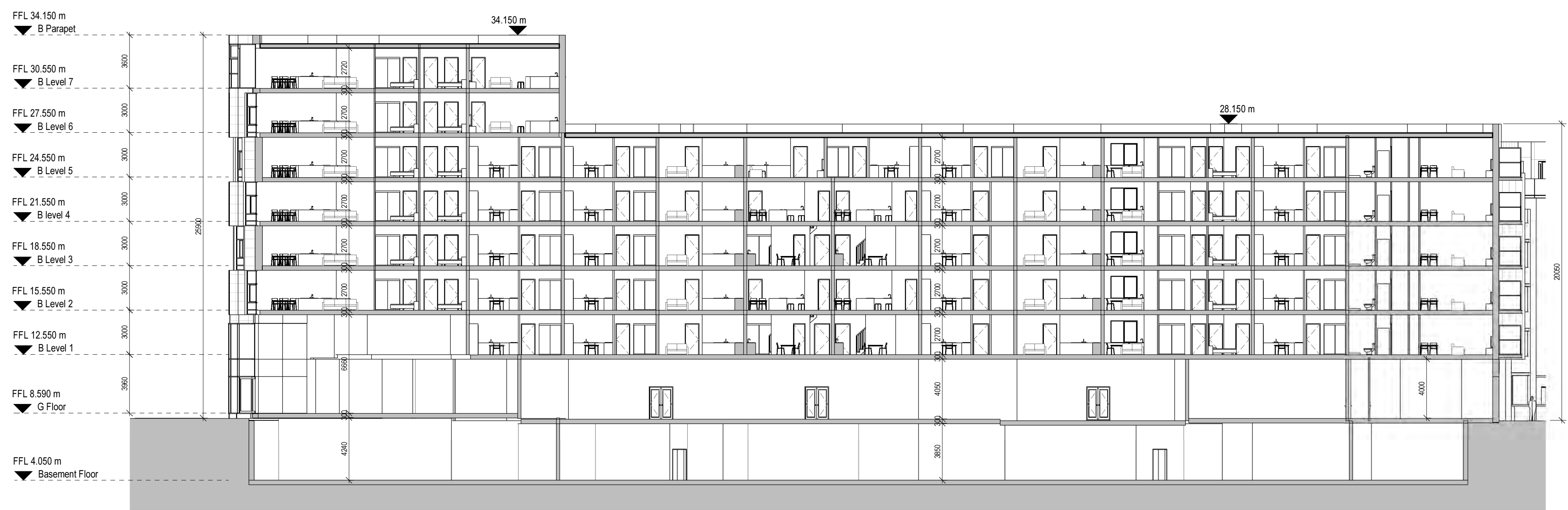
BLOCK 14B SECTION D-D Scale 1 : 200